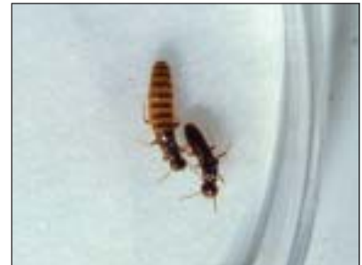
Kings and queens can thrive for up to eight years in the lab, raising ever-growing families.

The 30 complete colonies were censused periodically, most recently when the nests were 8 years old. During a census, each colony-nesting container was