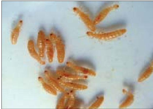
Replacement reproductives don't look exactly like the original kings and queens, but they do the same job.

Neotenic reproductives were identified in five of our 30 lab colonies, all of which retained one of their founding parents: four contained a surviving king and one a surviving queen. The queenless colonies contained exclusively female neotenics while the one kingless nest contained 127, mostly female, neotenics. Contrary to our expectations, the queenless and with-queen colonies were equivalent in total